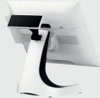
customer display VFD"