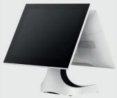
customer display 9.7"