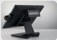
customer display LCM

LED backlight with low power consumption and long service life (more than 50,000 hours). Very robust die-cast aluminum chassis. Front and rear dust and waterproof in accordance with IP64. Quiet, fanless cooling system (fanless).