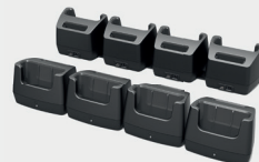
Multiple Charging Cradle