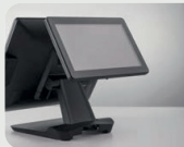
customer display 8,4"